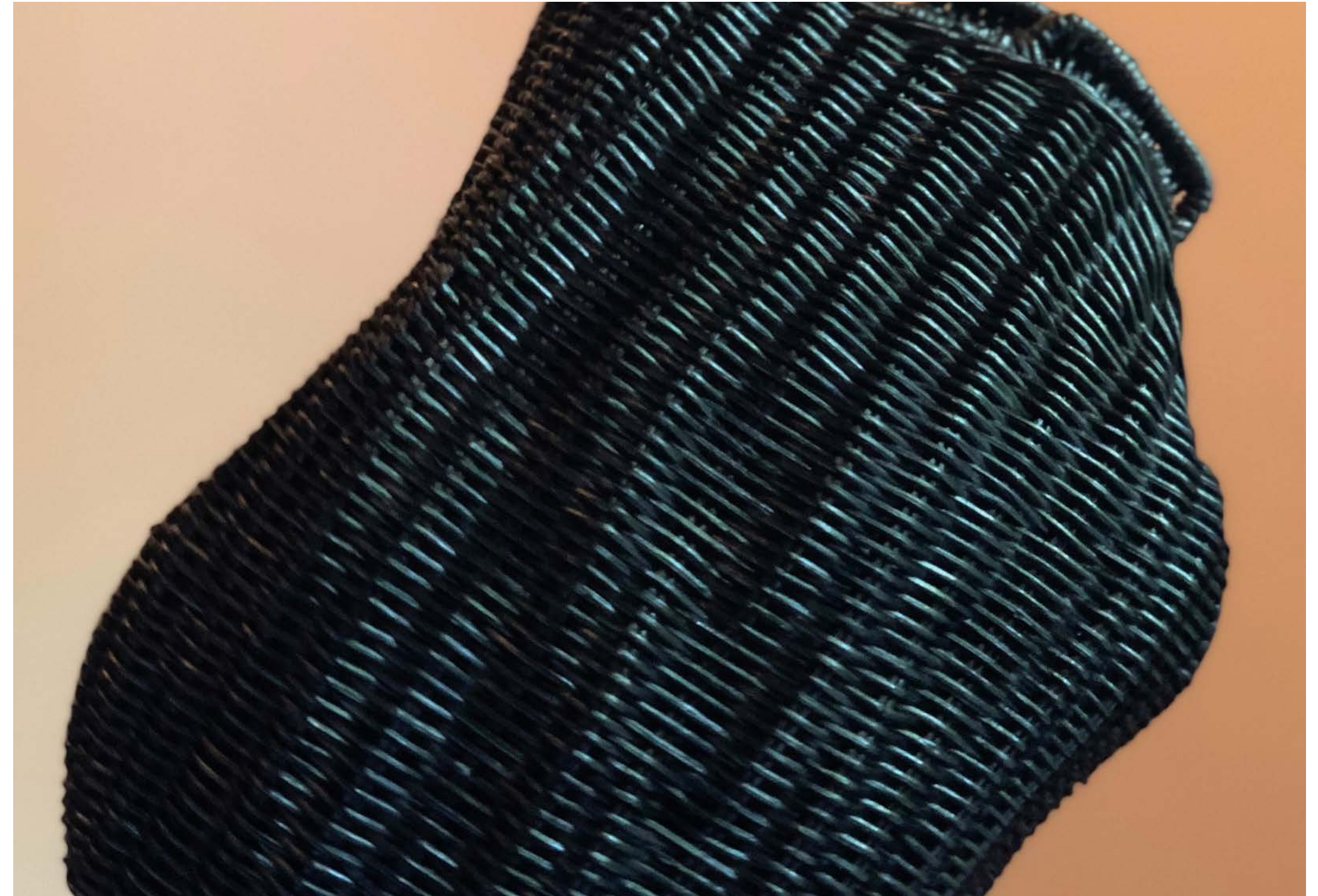
Monolith Sedona Clutch