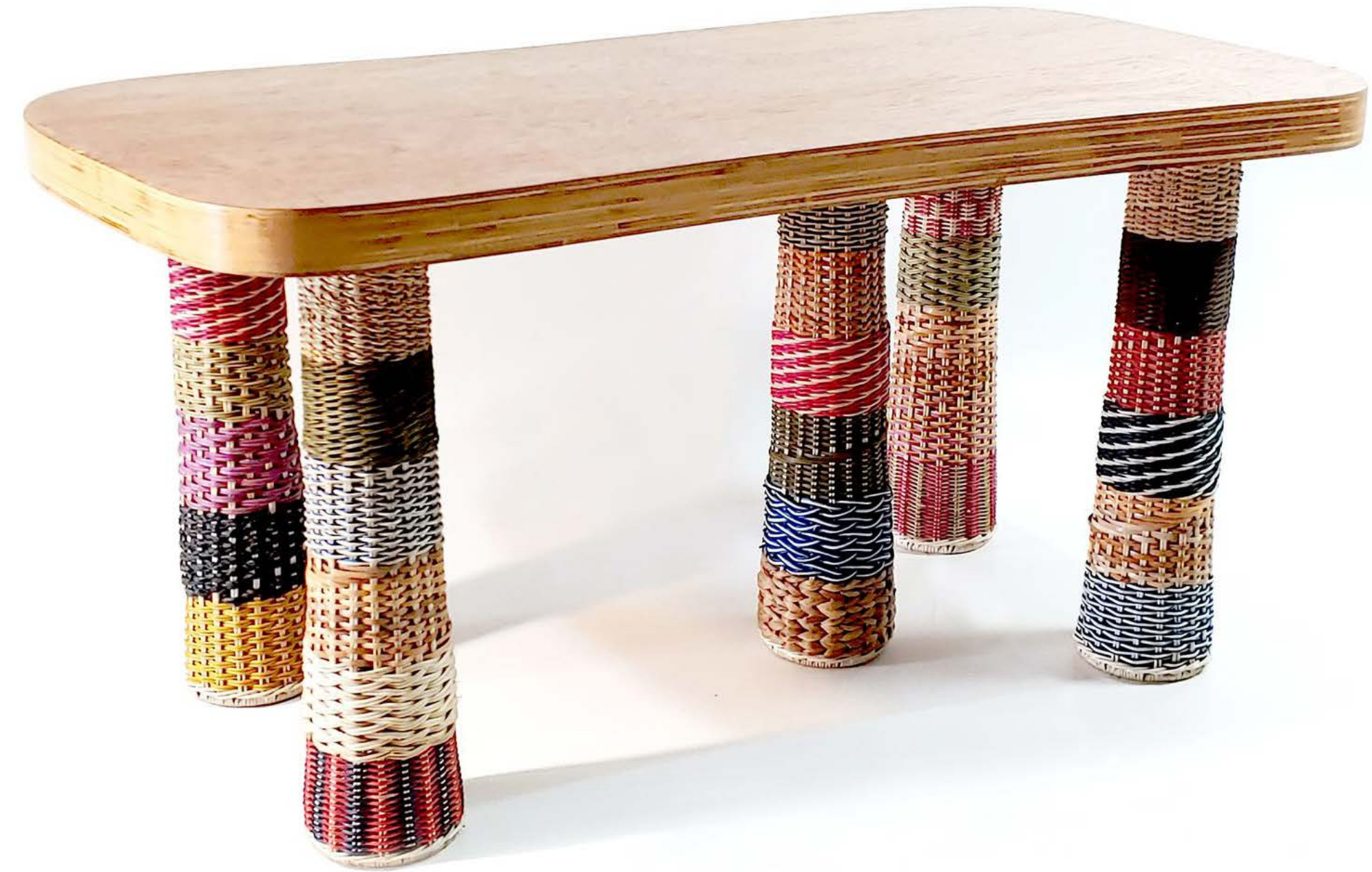
3L/5L Table Zacarias 1925 x Miguel Rosales