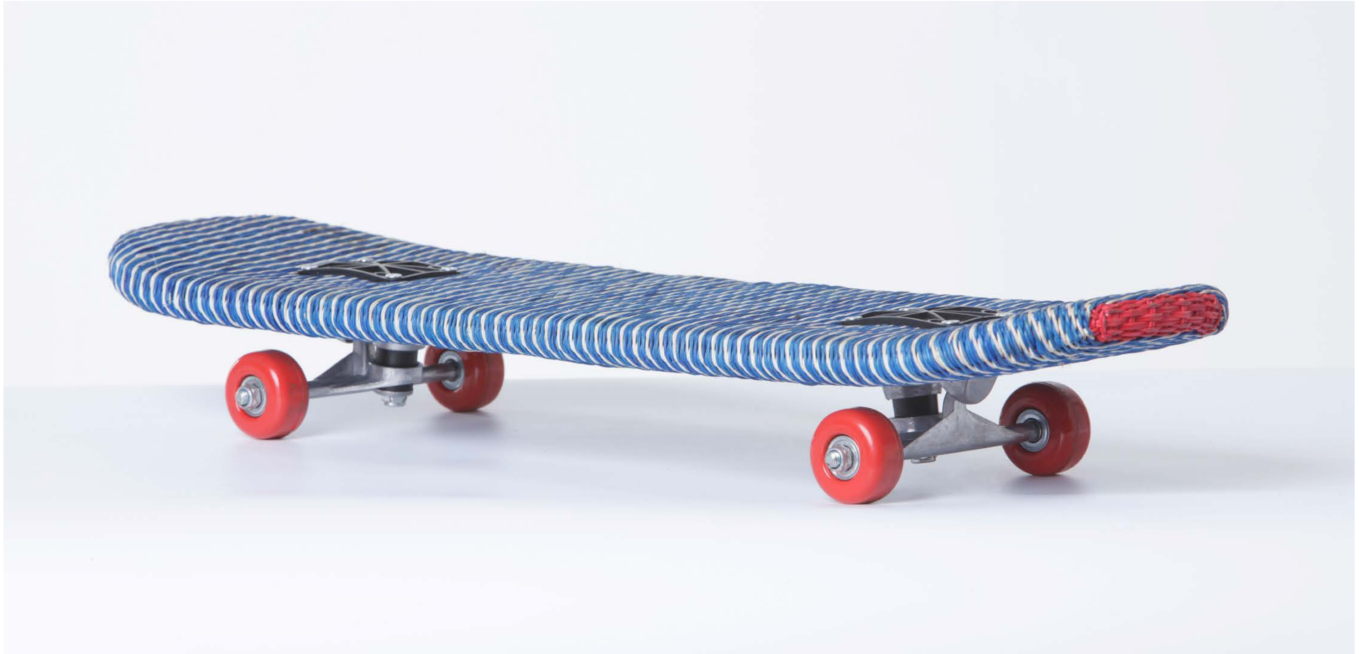
Skateboard Zacarias 1925 x Nazareno/Lichauco