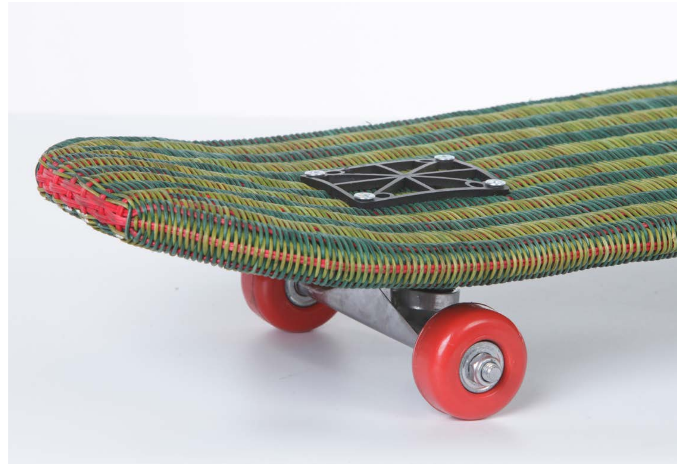
Skateboard Zacarias 1925 x Nazareno/Lichauco