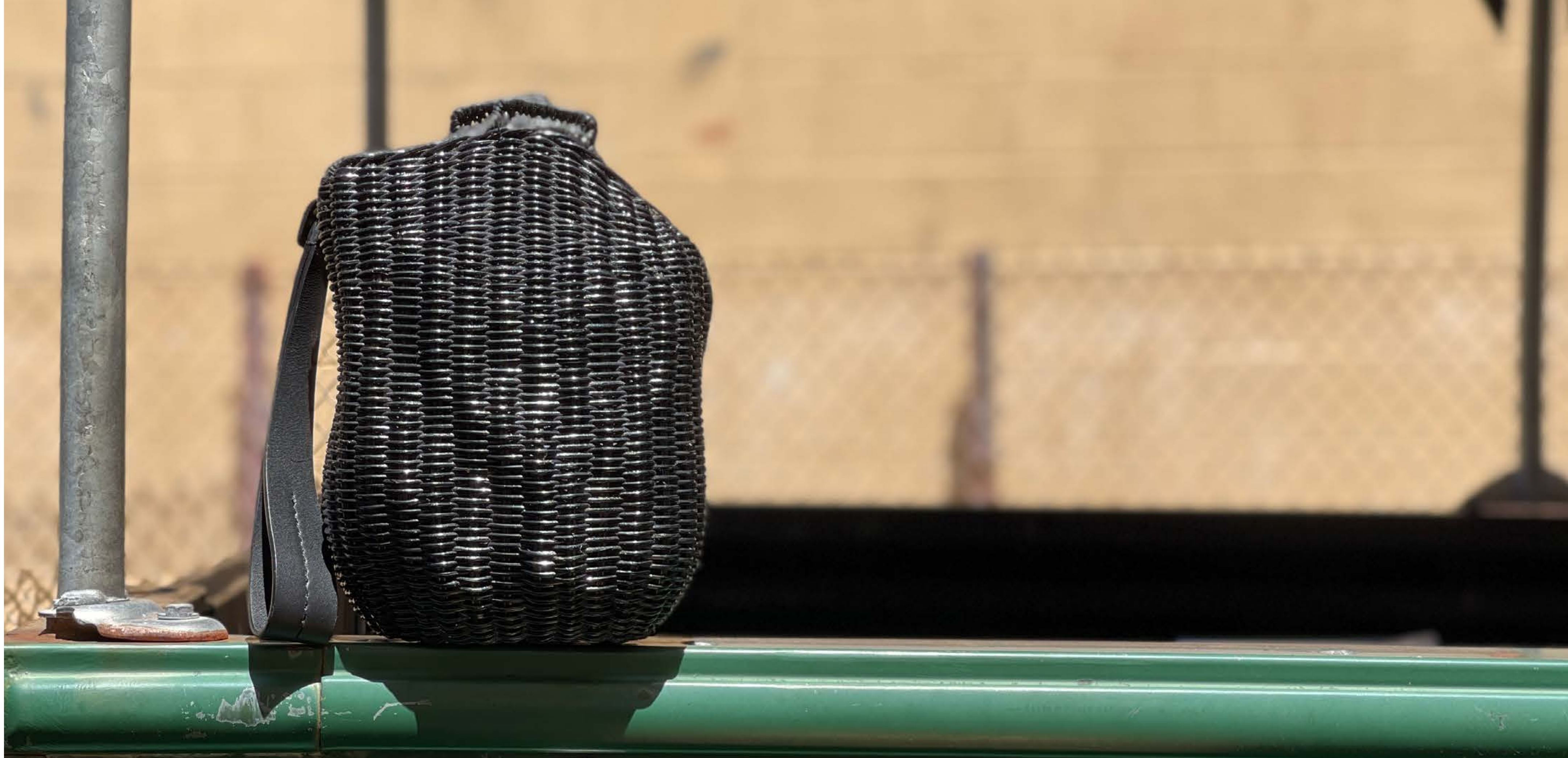
Monolith Sedona Clutch