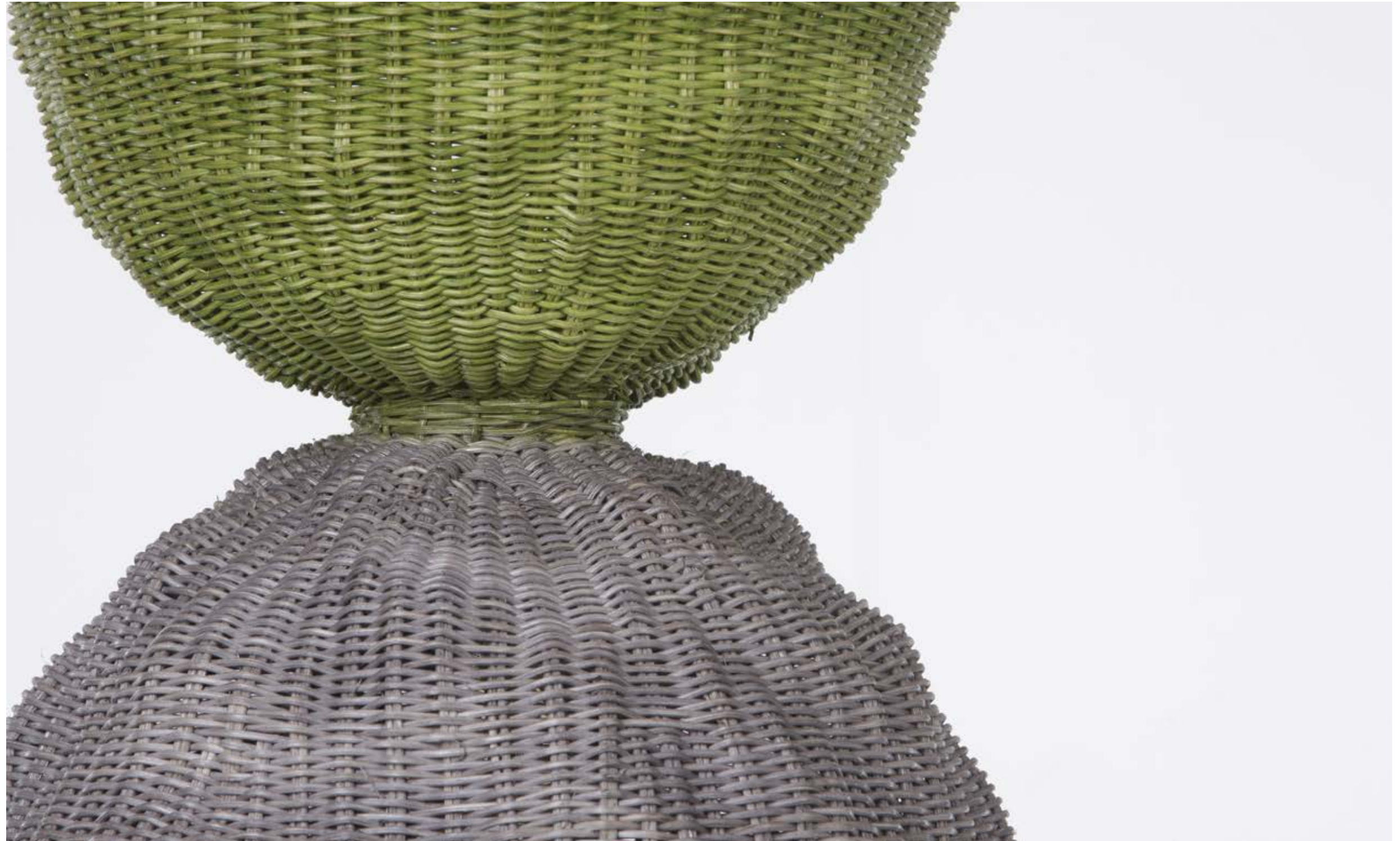
Monolith Totem Lamp Zacarias 1925 x Nazareno/Lichauco