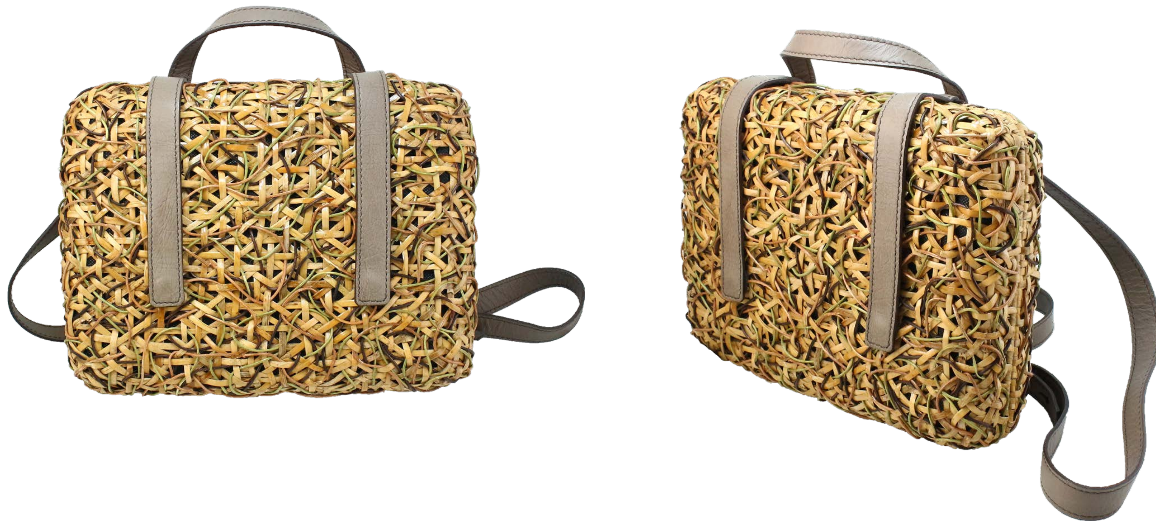
Ovolo Loops Bag