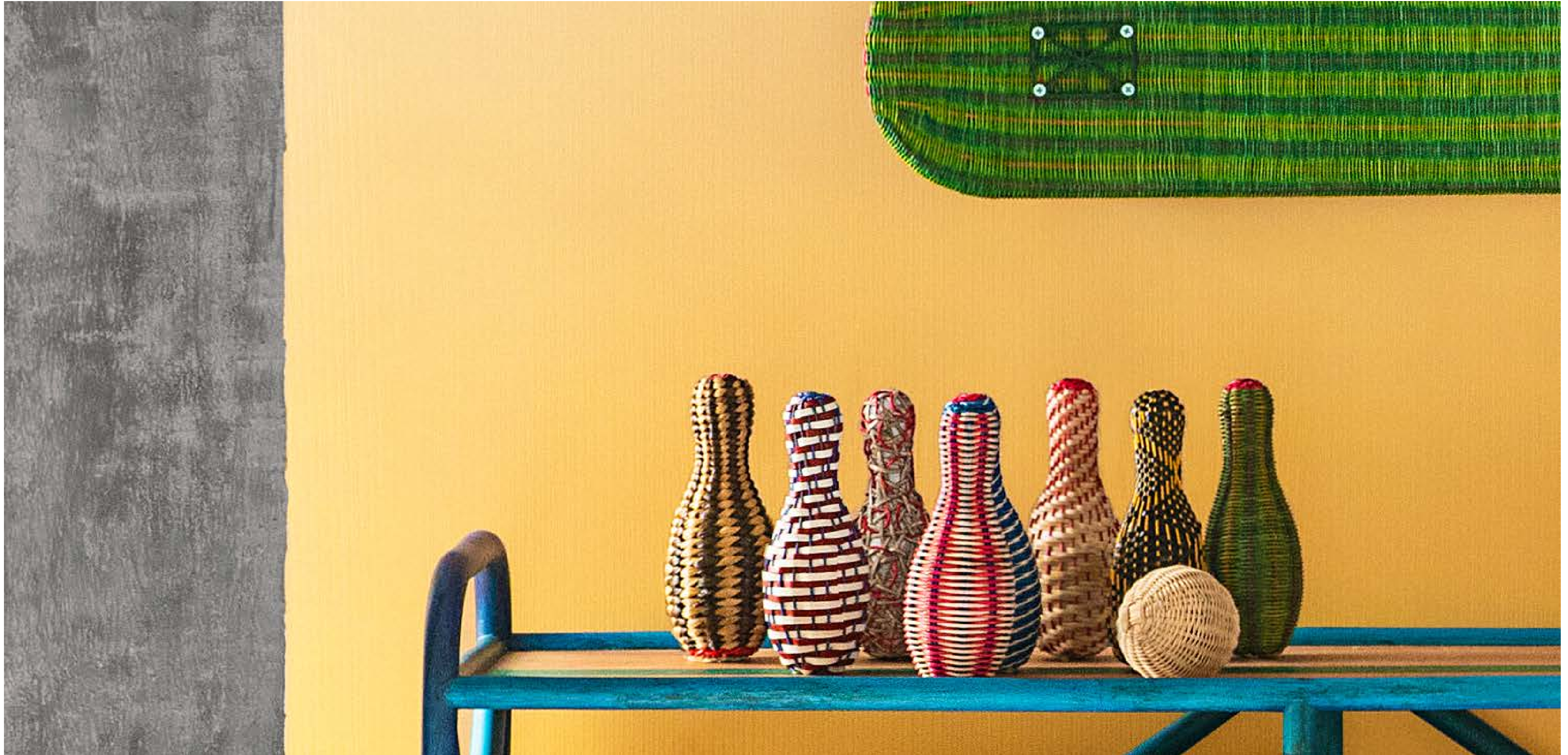
Duck Pins Zacarias 1925 x Nazareno/Lichauco