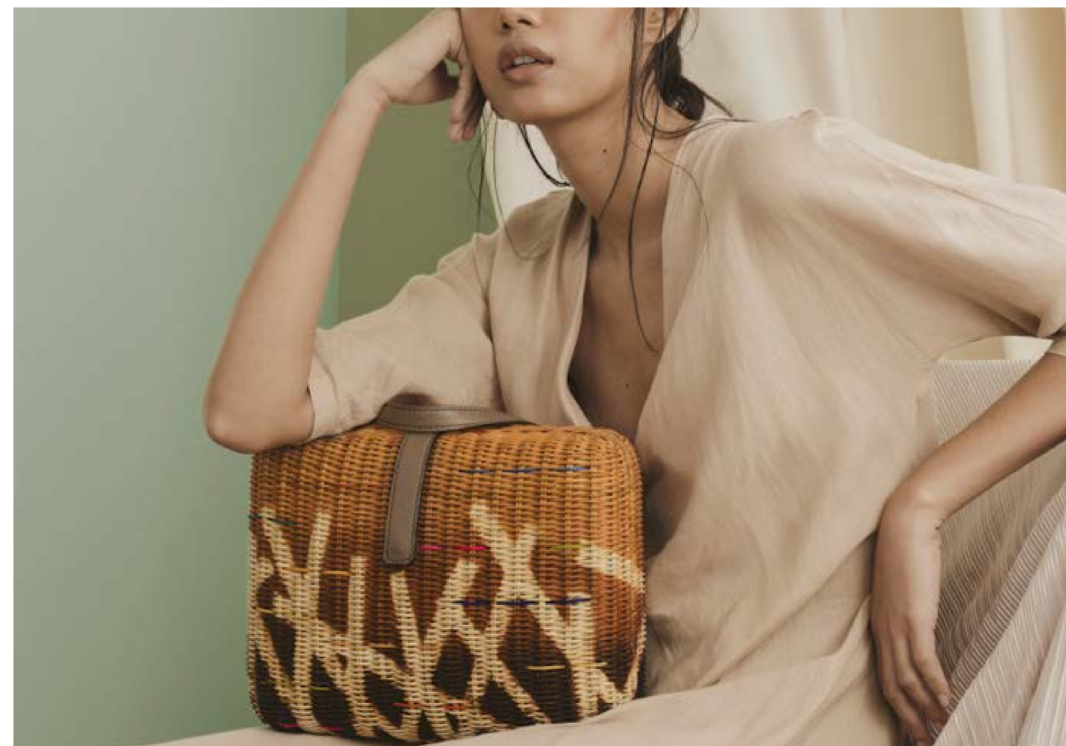
Julie Ovolo Bag