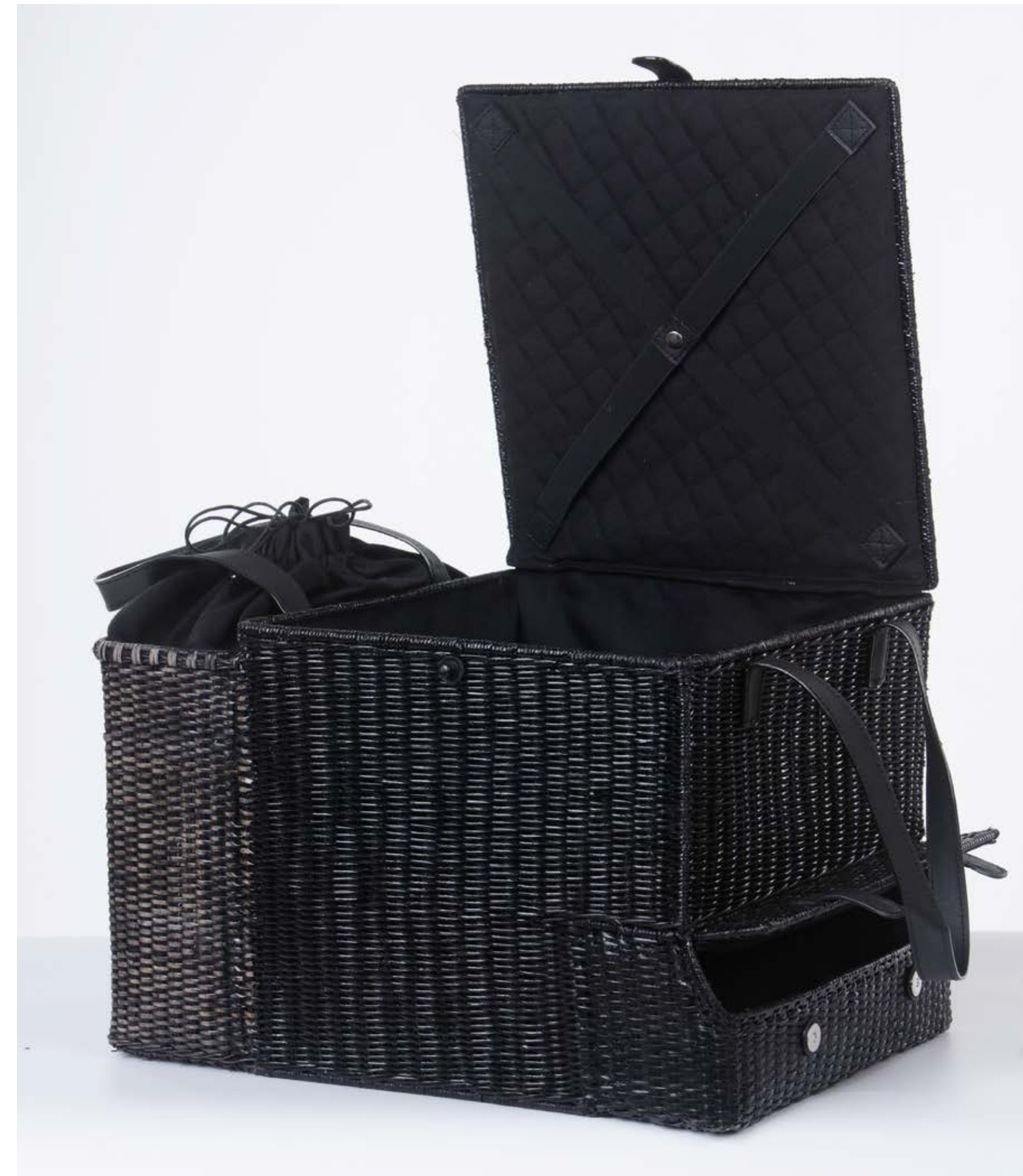
Brutalist Picnic Basket