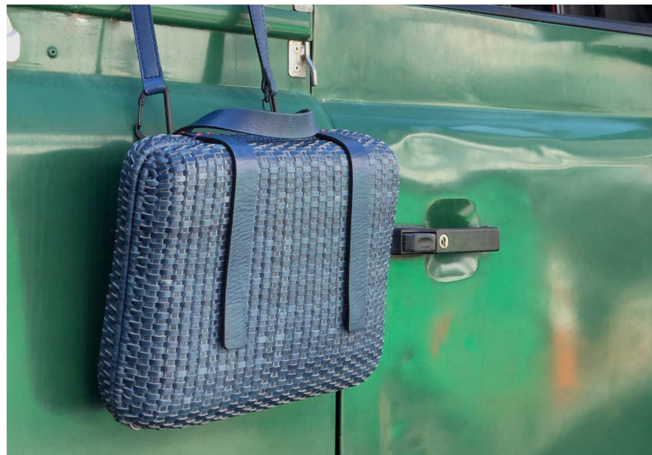
Ovolo Leather Bag